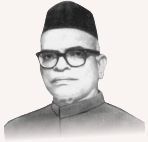
Hon'ble Dhananjayrao Gadgil