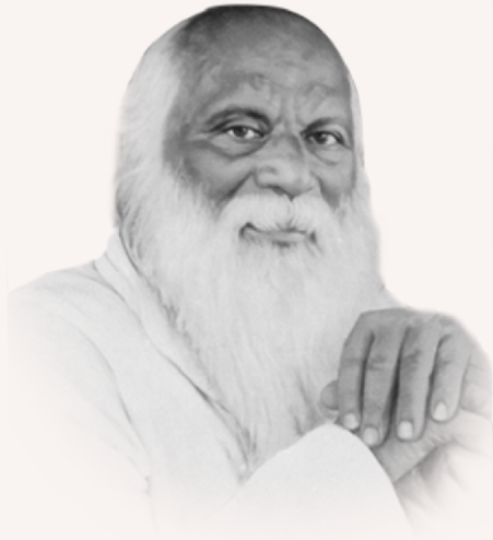
Padmbhushan Dr. Karmaveer Bhaurao Patil